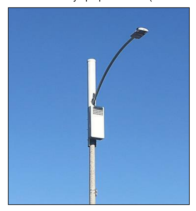
Figure 4: Flush-mounted radio shroud.

(4) Orientation. Unless placed behind a street sign or some other concealment that dictates the equipment orientation on the pole, all pole-mounted accessory equipment should be oriented away from prominent views, and shall not substantially obstruct a view from the primary living area of a residence. In general, the proper orientation will likely be toward the street to reduce the overall profile when viewed from the nearest abutting properties. If orientation toward the street is not feasible, then the proper orientation will most likely be away from oncoming traffic. If more than one