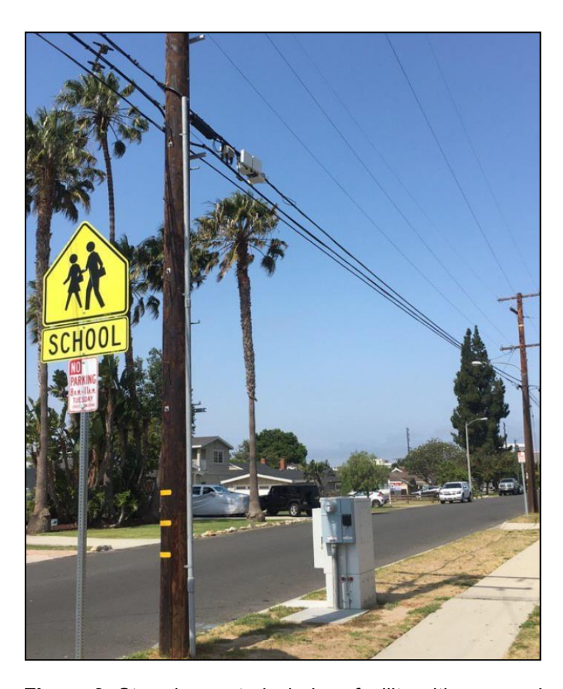
Figure 8: Strand-mounted wireless facility with a ground-mounted remote power source.