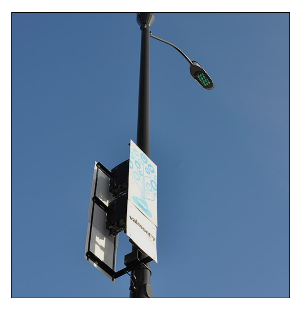
Figure 5: Accessory equipment concealed behind banners.

orientation would be technically feasible, the Director may select the most appropriate orientation.