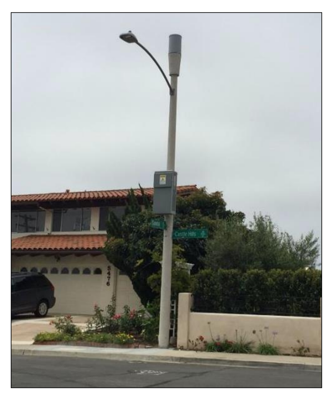
Figure 1: Antenna concealed within a single shroud (or radome) with a tapered cable shroud between the antenna and pole-top

(2) Antenna Volume. Each individual antenna associated with a single small cell shall not exceed three cubic feet. The cumulative volume for all antennas on a single small cell shall not exceed: (i) three cubic feet in residential areas; or (ii) six cubic feet in nonresidential areas. Notwithstanding the preceding sentence, the Director may grant an exception when the applicant demonstrates by clear and convincing evidence that compliance with this section would not be technically feasible.