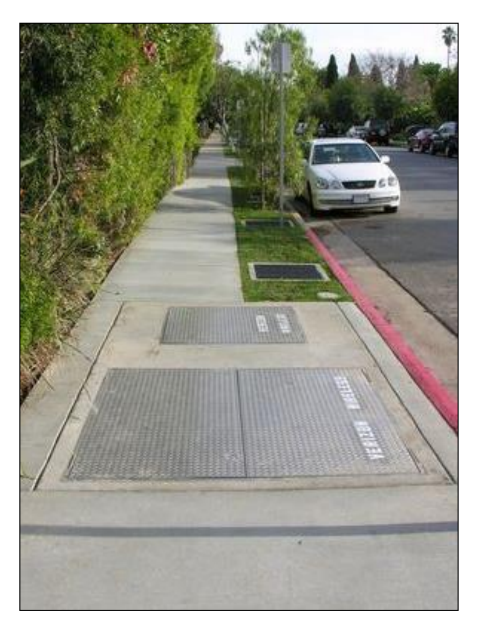
Figure 3: Flush-to-grade underground equipment vault.