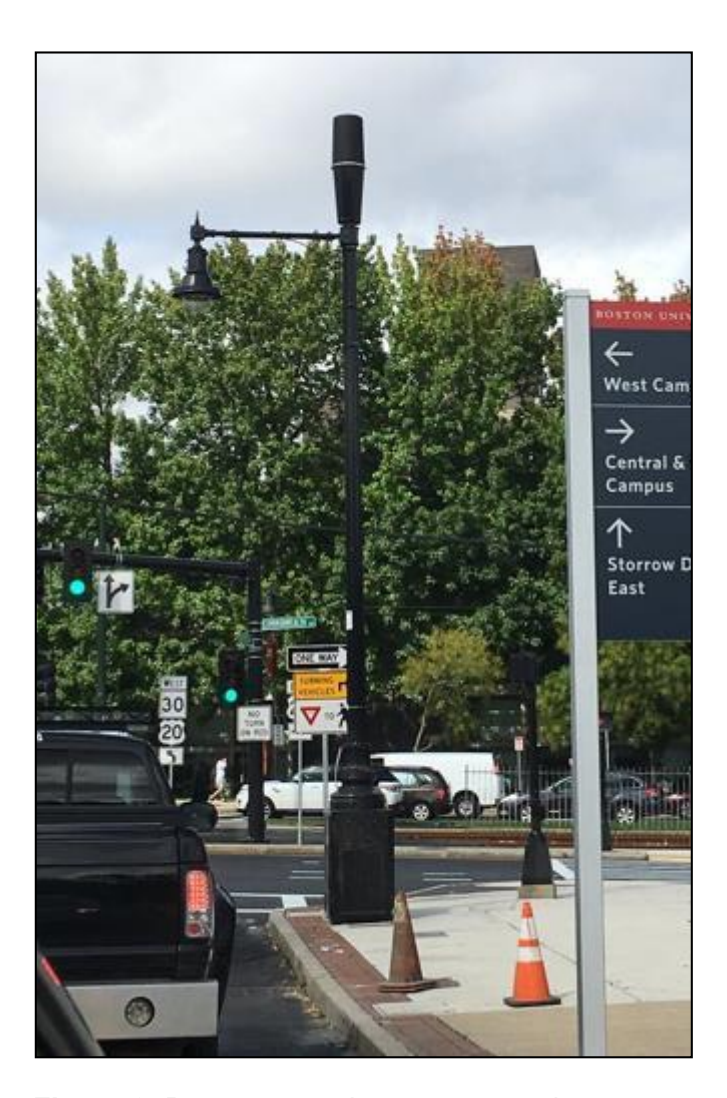
Figure 6: Base-mounted accessory equipment.

(1) Ground-Mounted Concealment. All ground-mounted equipment cabinets shall be placed six inches behind the sidewalk, at least two feet from the curb, and two feet from driveway and curb edges. Pedestals must be at least three feet from fire hydrants. Installations must leave a minimum horizontal clear space for the path of travel of at least six feet. The Director may require more clear space for travel in heavily used commercial areas to provide sufficient room for pedestrian traffic. On collector streets and local streets, the City prefers ground-mounted accessory equipment to be concealed as follows: (i) within a landscaped parkway, median or similar location, behind or among new/existing landscape features and painted or wrapped in flat natural colors to blend with the landscape features; and (ii) if landscaping concealment is not technically feasible, disguised as other street furniture adjacent to the support structure, such as, for example, mailboxes, benches, trash cans and information kiosks. On major streets outside underground districts, proposed ground-mounted accessory equipment should be completely shrouded or placed in a cabinet substantially similar in appearance to existing ground-mounted accessory equipment cabinets.