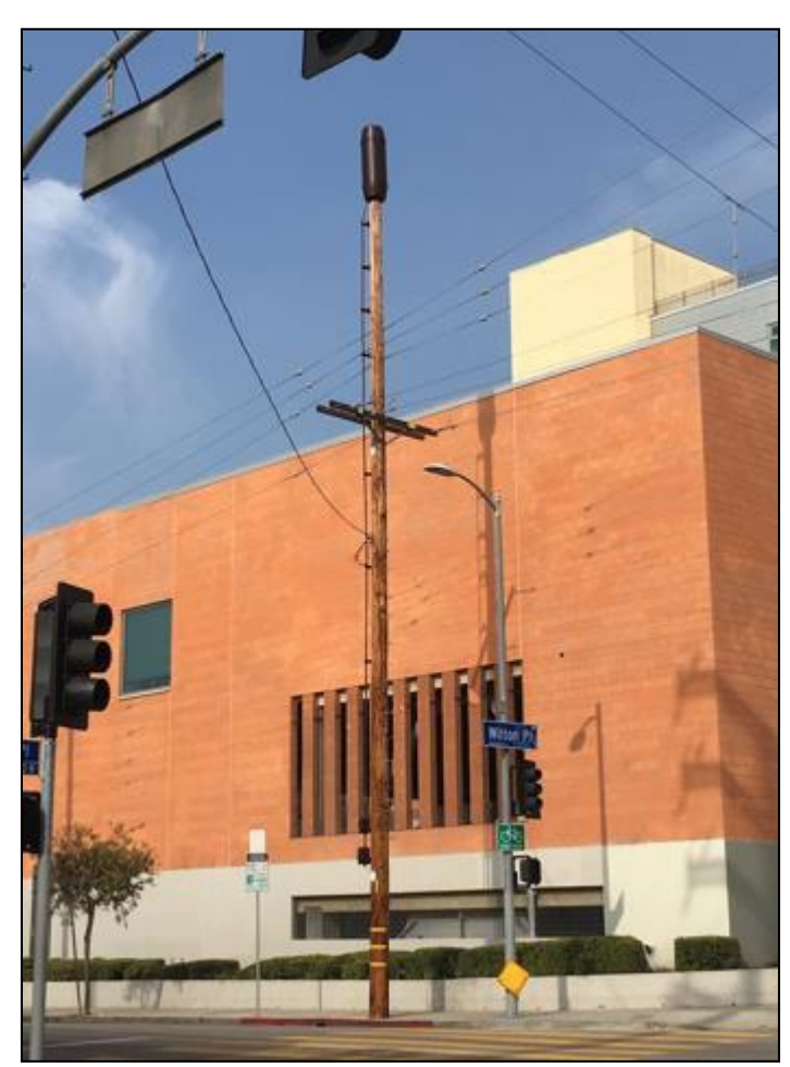
Figure 2: Pole-top antenna on a wood utility pole with tapered shroud.

(i) Accessory Equipment Volume. The cumulative volume for all accessory equipment for a single small wireless facility or other infrastructure deployment shall not exceed: (i) seven cubic feet to the extent feasible, but in no event greater than nine cubic feet in residential areas; or (ii) 12 cubic feet in nonresidential areas. The volume limits in this subsection do not apply to any undergrounded accessory equipment.